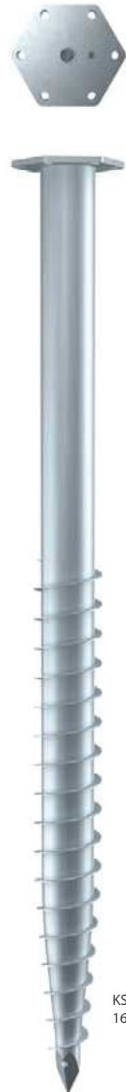
KSF M 89x 1600-M24